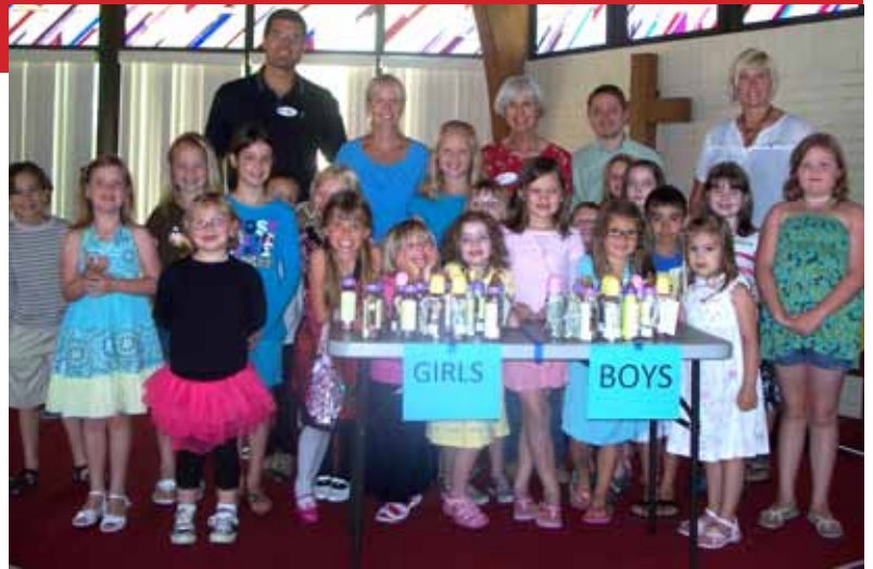
Memories from 2011 Baby Bottle Fundraiser

Camp Ghormley – ghormleymeadow.org Twinlow and Lazy F - pnwumc.org/camping